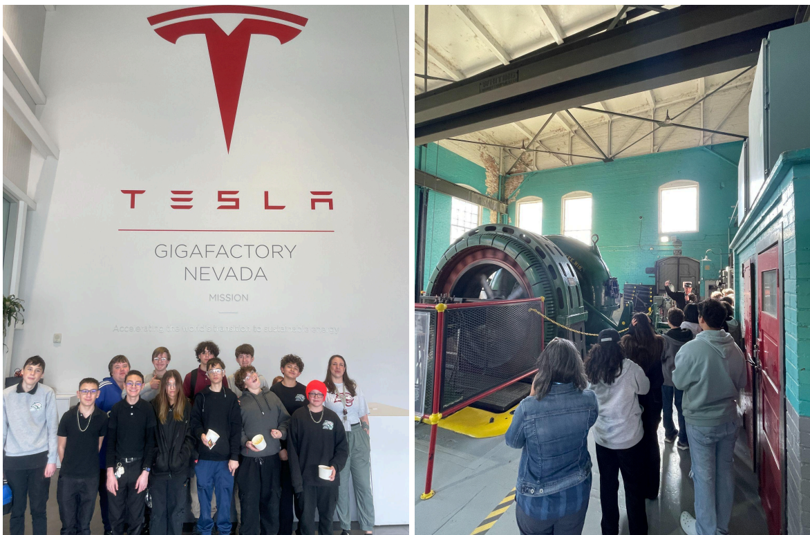
Cold Springs Middle School students at Tesla (left) Dilworth Middle School Students at Truckee Meadows water Authority (right)