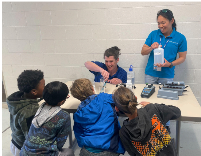
Students from Dilworth Middle School at Tesla (left) students from Mamie Towles Elementary School at Truckee Meadows Water Authority (right)