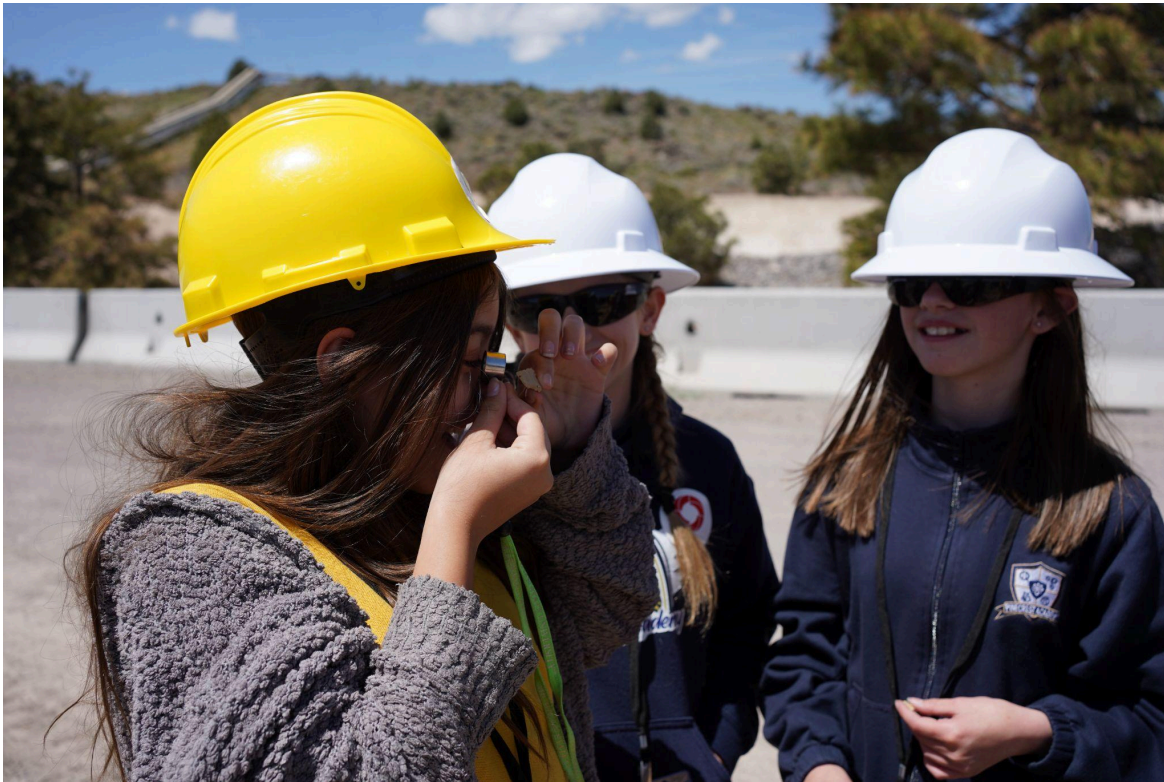
Pictured Above: Students making observations at Ormat