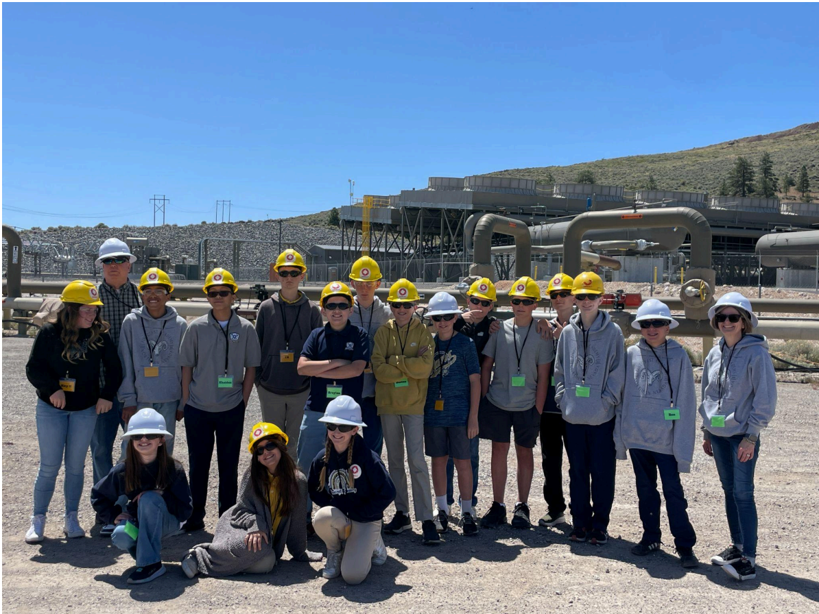
Pictured Above: Middle School Students from Pinecrest Academy of Northern Nevada at Ormat Steamboat Hills

The Ormat Career Quest events have multiple educational components to enhance the student experience. Each event has students listen to a presentation regarding the history and operations of Ormat, students participate in a hands-on activity that demonstrates how pressure differentials are used in the geothermal energy industry, and students are given a tour of multiple components of the Ormat Steamboat Hills facility. Envirolution was able to expand Career Quest to Ormat as part of a one-year grant from the EPA to promote the growth of geothermal energy in Nevada.