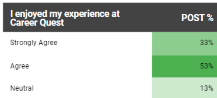
Figure 5 shows students' attitudes regarding understanding the event quality of Career Quest at Ormat *Note "Disagree" and "Strongly Disagree" are options that no students selected